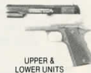
UPPER & LOWER UNITS